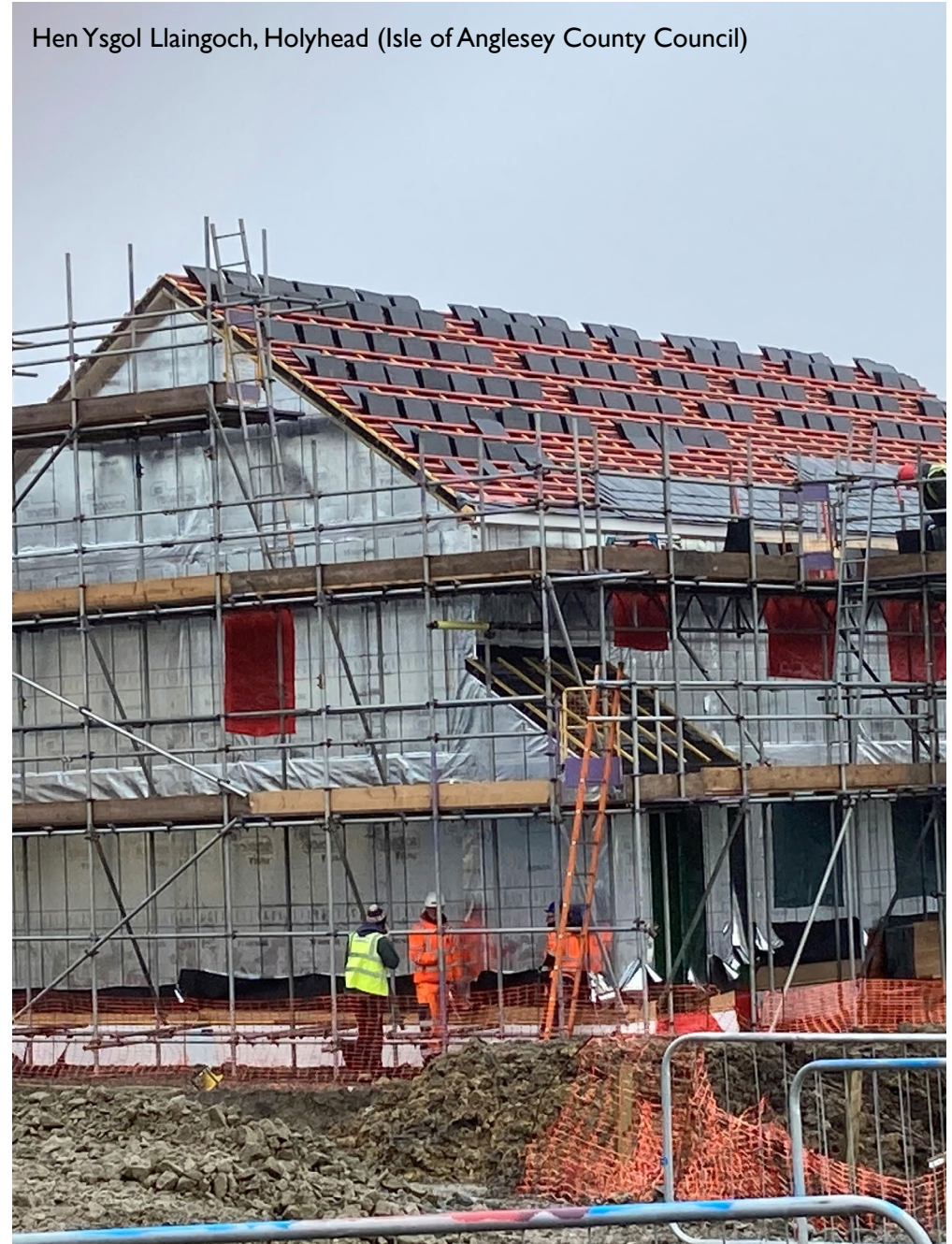
Hen Ysgol Llaingoch, Holyhead (Isle of Anglesey County Council)

A Strategy which set outs the expectations relating to the production of homes built using Modern Methods of Construction which encourages complimenting traditional construction methods with new technologies and approaches.