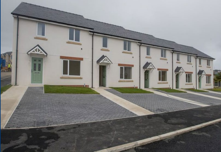
Stad Marcwis, Rhosybol (Isle of Anglesey County Council)