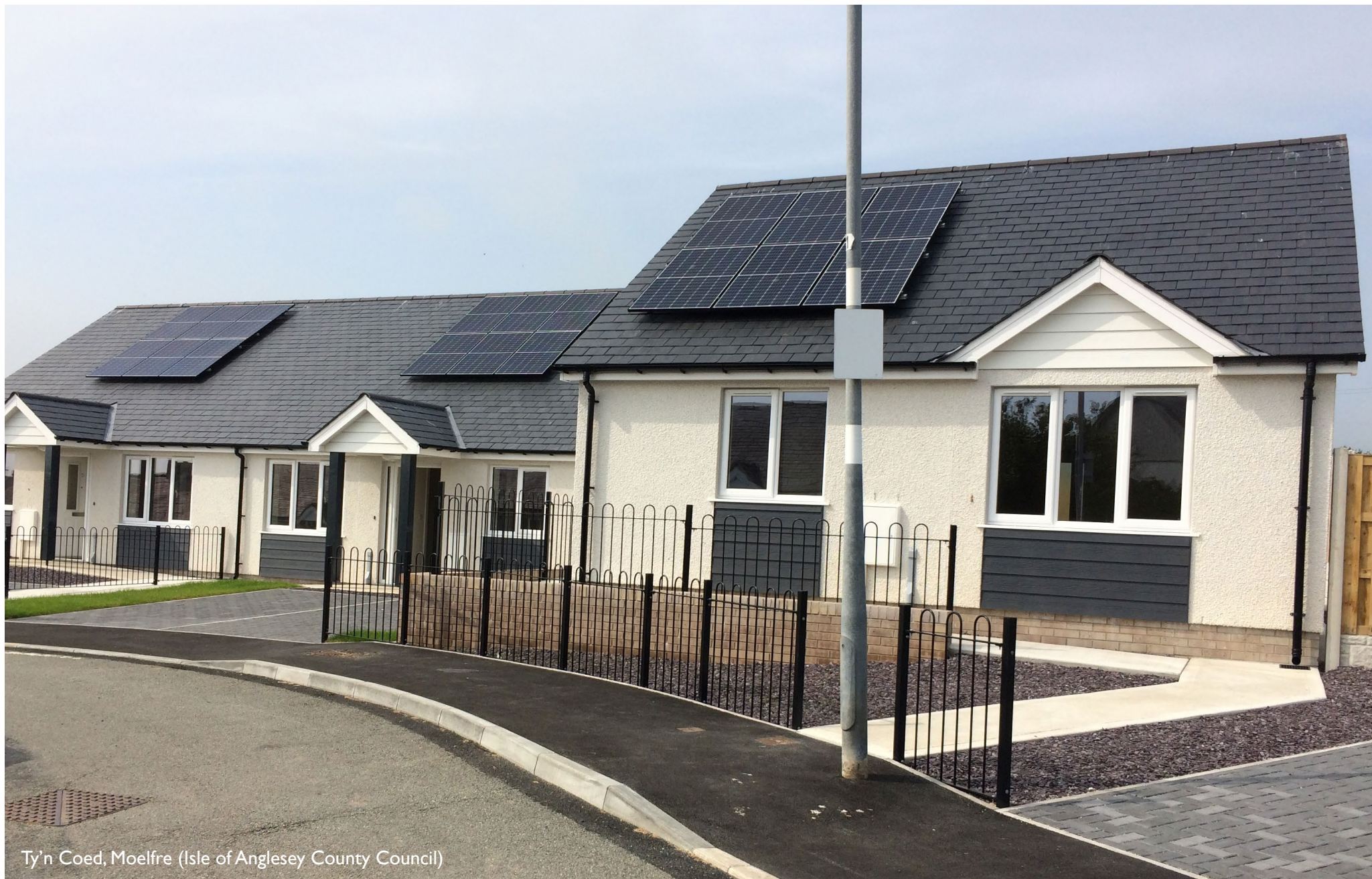
Ty'n Coed, Moelfre (Isle of Anglesey County Council)