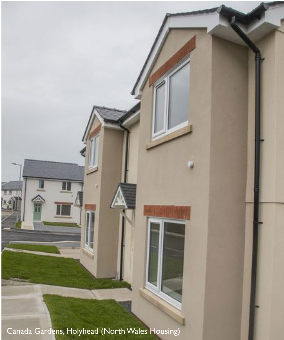
Canada Gardens, Holyhead (North Wales Housing)